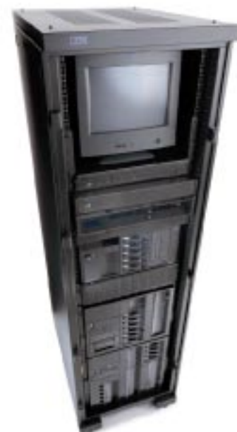
Netfinity 42U 3 Full-Height Rack

As your requirements for storage size and security increase, consider Netfinity Fibre Channel storage solutions designed as the large enterprise storage solution. For environments where availability and performance are critical, we've built in hot-pluggable redundant fans and power supplies, GB interface converters, and a 64/32-bit PCI-to-Fibre Channel Arbitrated Loop (FCAL) adapter. IBM Netfinity Fibre Channel supports distances up to 10km (6 miles) and data transmission rates of up to 100MBps.