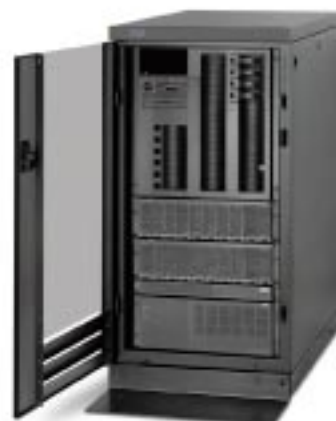
Netfinity NetBAY22 Half-Height Rack