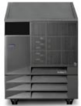
IBM Netfinity 5500